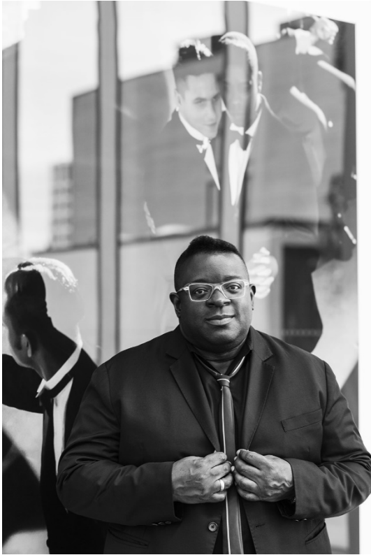
Isaac Julien.